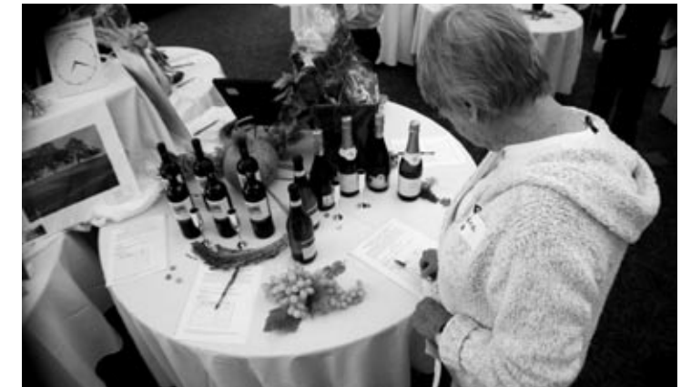
Our motto is "Party hard, bid high, eat well and go home happy knowing you preserved more 'Open Space. For All of Us.'"