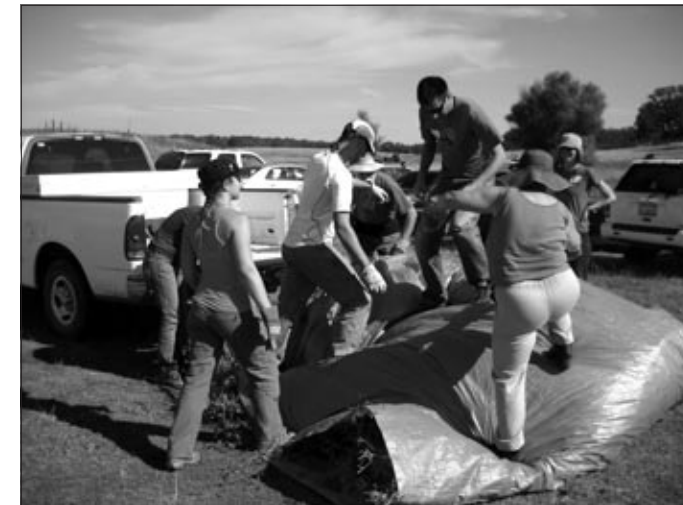
Who needs a jump house when you have a tarp and starthistle?! See Deer Creek Hills October Service Day article inside.

We will now form a Deer Creek Hills Preserve Advisory Council consisting of designated representatives from each of the ownership and funding partners (Sacramento County, CA State Parks, CA Department of Fish and Game and SVC), interested community groups and surrounding landowners and ranchers. This council will meet annually, but ad hoc meetings could be requested at any time by members of the council. This council