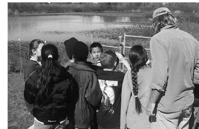
Robla students study nature at Hansen Ranch (See Front Page)

Keep watching for future SVC member events. Plan to enjoy live jazz, landscape art and photography, food and libations at our annual Treasures of the Valley event on October 4 from 5:30-8pm at the CSUS Alumni Center. Support SVC, have fun!