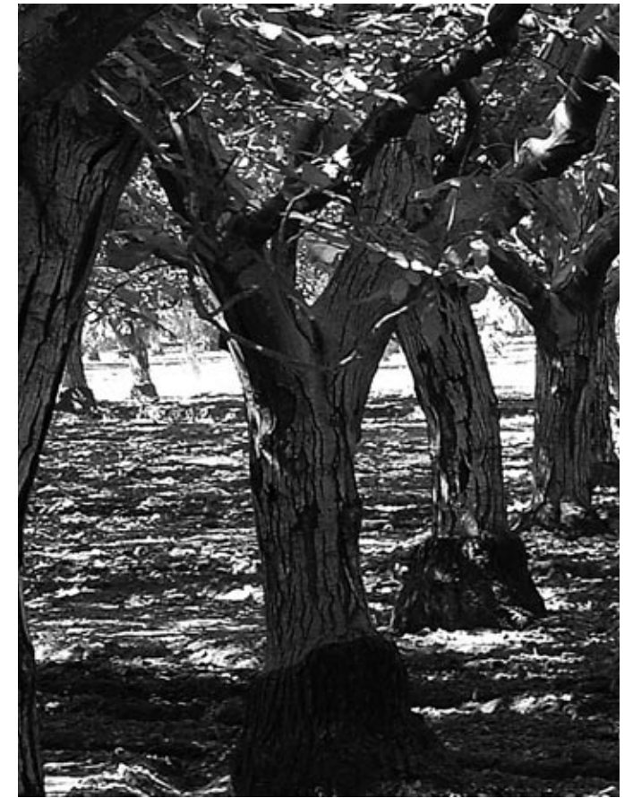
Elkhorn Basin Ranch walnut trees get ready for summer.